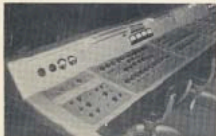
Master Control at Warner's

ABOUT VITAPHONIC STEREO: This is an outstanding Vitaphonic Stereo recording, every note of which was originally recorded live or multi-channel stereophonic techniques. This recording is a guaranteed original stereo record, and no a pre 1958 conversion from older monaural masters. See your record dealer for complete information regarding the use of your stereophonic playback equipment.